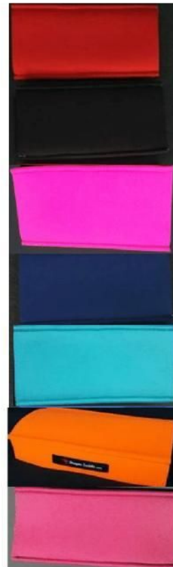
Burgundy (much darker than shown in picture) More of a wine colour